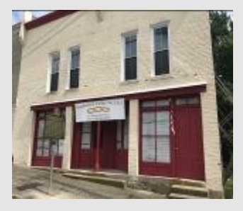
New Castle Main Street, Inc.